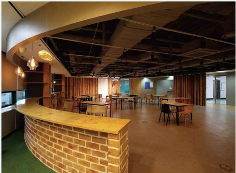
Hall for All - seating capacity 80 people

Non-profit groups, public interest advocates, small groups, and project teams may use these spaces. By offering these spaces, we aim to create a virtuous cycle of sharing and encourage the sharing movement.